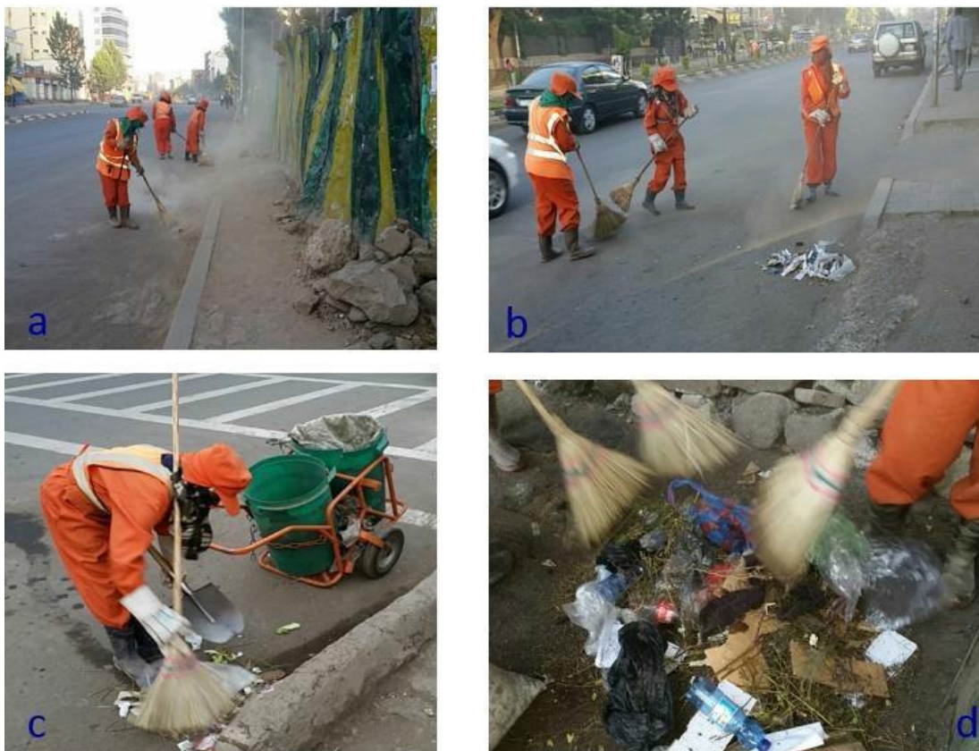
Figure 3: Street sweeping: a-Sweeping; b-collecting; c-dumping litters into dust bin; d-Sorting litters, Nov 2016

The exposure to dust presumably depended on the time covered and the intensity of sweeping. The first km had much sweeping and heavy dust plumes, as the sides are routinely busy with accommodating taxis and road-side businesses such as street food selling and many other nameless petty things. These activities are known to involve massive human movements which leave themselves things like litter, dirt, papers, plastic bags, leaves and straws of khat , used mobile phone cards, card boards, and debris (Figure 3).