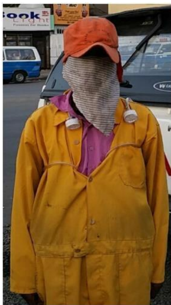
Front side arrangement

Data collection and measurement: The study was conducted from 22 nd -25 th November, 2016 in Addis Ababa (i. e, for 4 days, 5 samples per day). Personal total dust was sampled in the breathing zones (about 30cm from the workers nose) using a 37mm diameter of Millipore plastic sampling cassette fitted with polyvinyl carbonated (PVC) filters of 5µm pore size connected to Side Kick Casella (SKC) pumps operating at 2l/min (Figure 2). The position of the sampling head was on both sides (left and right), having each 50% of the sampling duration with the purpose of getting about equal measurements in both sides. The position of the neck (hence breathing position) is expected to adjust the flow of the swept dust in air.