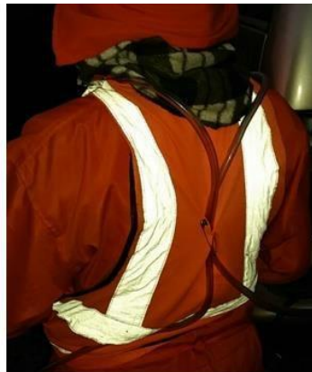
Back side arrangement